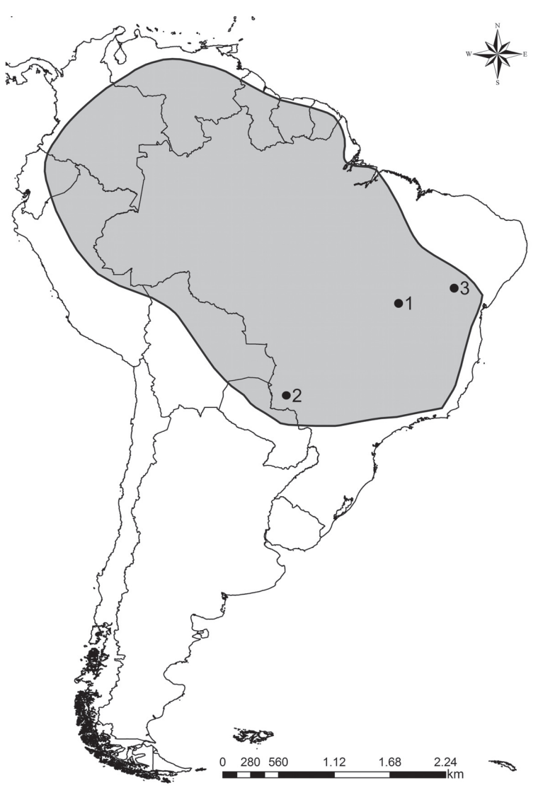
Figure 3. Current geographic distribution of the snake Eunectes murinus in South America (in gray). 1, Eunectes murinus , late Pleistocene, Gruta do Urso cave, State of Tocantins; 2, Eunectes sp., Quaternary, found in the Buraco do Japonês cave, State of Mato Grosso do Sul, at the municipality of Bonito; 3, Eunectes murinus , Quaternary, found in Lapa dos Brejões cave, State of Bahia, at the municipality of Morro do Chapéu. Records 2 and 3 were assigned by Camolez & Zaher (2010).

Remarks. The specimen UNIRIO-NM 0001 is assigned to the genus Eunectes on the basis of the following features: large size, slightly depressed neural arch, robust and moderately thick zygosphene with a prominent median tubercle (Hsiou & Albino, 2009). Moreover, the taxonomic assignment of the specimen described above to Boidae is based on the following combination of vertebral characters shared with the genera of extant Neotropical boines: robust, high, short and wide vertebrae; although incomplete, the neural spine is apparently well developed; relatively thick zygosphene; low inclination of the articular facet of the prezygapophysis (less than 15°); short prezygapophyseal process; vertebral centrum short; marked precondylar constriction; haemal keel well developed in the mid-trunk vertebrae instead of a hypapophysis (Rage, 2001; Lee & Scanlon, 2002; Szyndlar & Rage, 2003; Albino & Carlini, 2008).